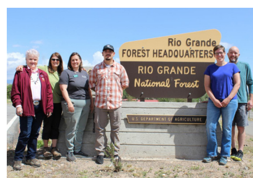
NEW RGNF Adopt-a-Road

Since 1988, volunteers have been a critical asset to all of SJMA’s programs. 2024 saw an increase in volunteer programs from a brand new Adopt-a-Road Program in the Rio Grande National Forest to the adoption of 11 miles along the Colorado Trail from Molas Pass to Rolling Mountain Pass.