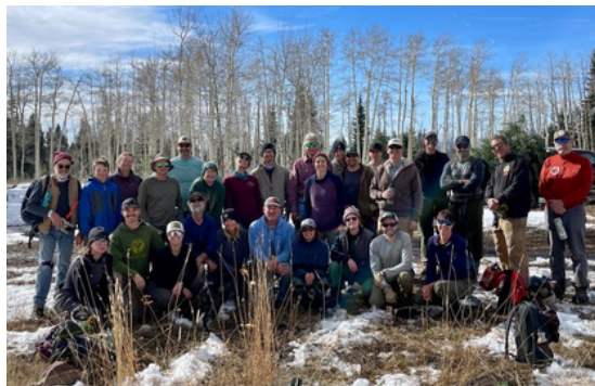
Christmas Tree Harvest Crew