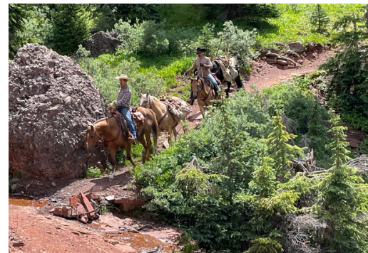
NEW CO Trail Cleanup/Maintenance