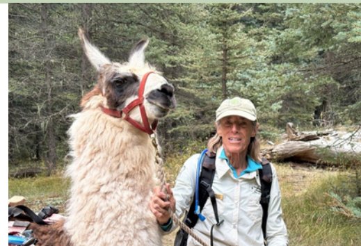
Dedicated volunteer helping with new Volunteer Project along Pine River Trail