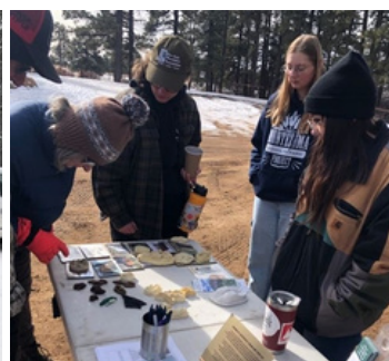
MIC Winter and Fall Family Days in Mancos & Dolores