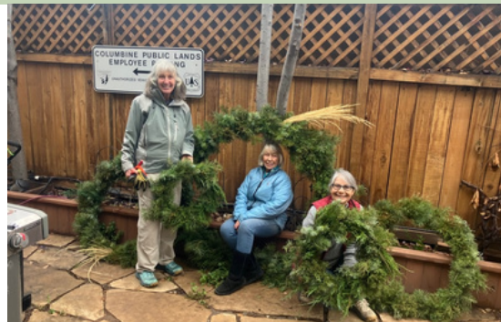
Wreath-making crew who made record-breaking 140 wreaths for sale at tree lot