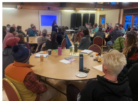
SJMA facilitating SCCORR meeting, Feb. 2025