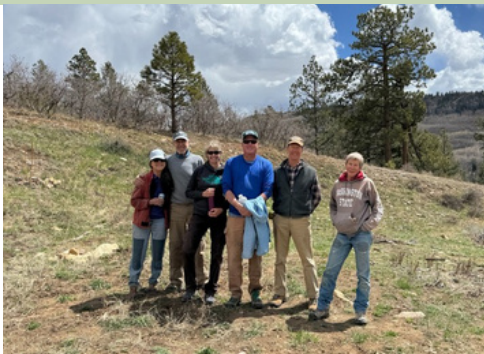
Volunteer Crew helping with Forest Road clean up project

VALUE OF VOLUNTEER TIME (Independent Sector) = $ 214,306